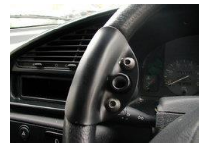
Steering ball – quick release peg means steering ball can be removed by other drivers.