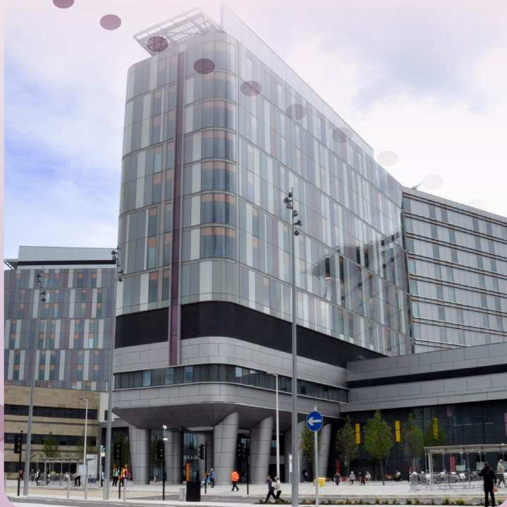
Accurate as at August 2017